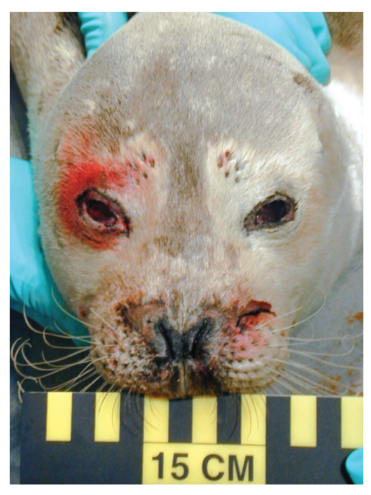
Figure 2. Face of harbor seal HS 8; periocular trauma and facial lacerations are typical of those sustained from forced sexual interactions with male sea otters.

External genital and perineal trauma, characterized by hemorrhages, skin lacerations, and swelling