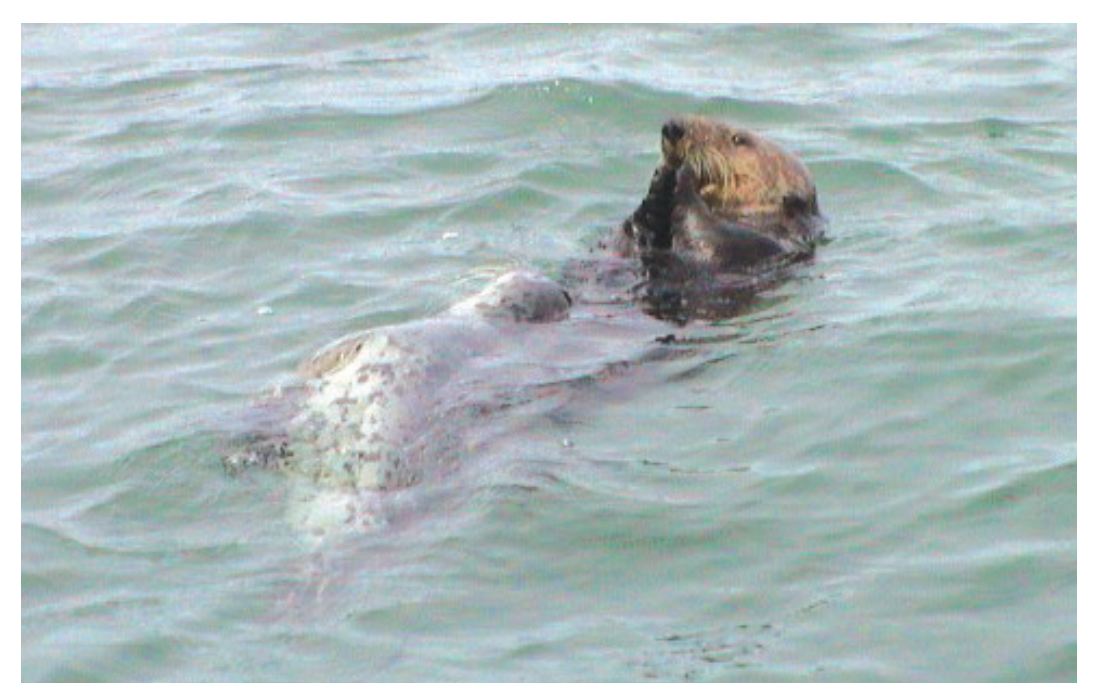
Figure 1. An untagged male sea otter guarding the carcass of an unidentified harbor seal pup while foraging in Elkhorn Slough, Moss Landing, on 20 April 2001; the pup was already dead when first observed, and the carcass was not recovered for necropsy.

sea otter released the pup, now dead, and began grooming. Unfortunately, this carcass was never recovered for necropsy.