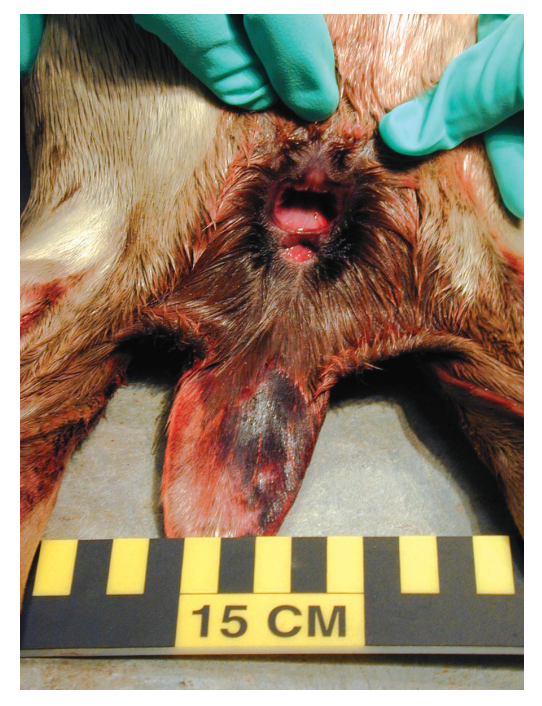
Figure 3. Perineum of harbor seal HS 8; mucosal excoriations and erythema, vulvar swelling, and blood staining on the hair coat surrounding the vaginal and anal orifices.

Traumatic colorectal perforations (n = 5) with leakage of intestinal contents into the abdominal cavity or perirectal soft tissues were found in four harbor seals and one sea otter, with both male and female animals affected. Colorectal perforations were 1 to 2 cm diameter, round, and were located 3 to 12 cm proximal to the anus. HS 10 exhibited